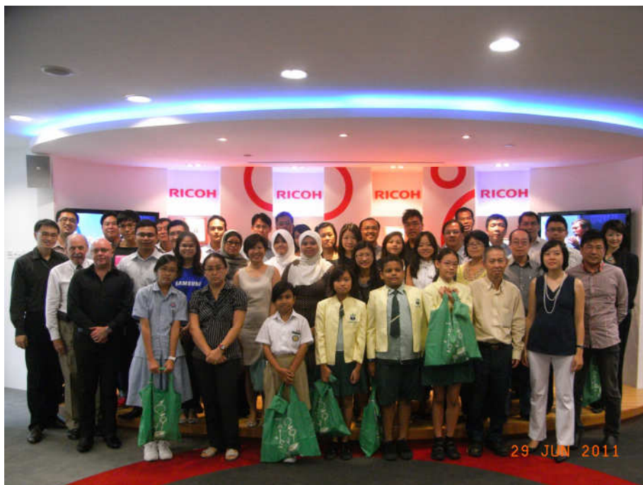
<Guests from participating organizations & Winning Schools during the post event ceremony at Ricoh Printing Innovation Centre>

The event was then wrapped up with a tour around Ricoh Asia Pacific office at level 8, the first private company in Singapore to be awarded by SEC for the Green Office Label in 2004.