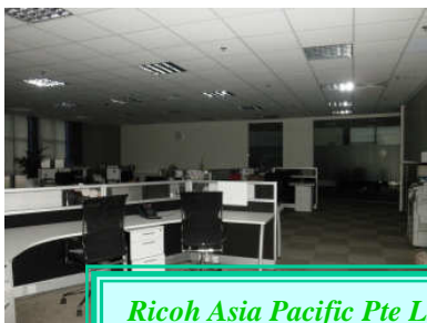
Ricoh Asia Pacific Pte Ltd

Some may questions on the sustainability of these organizations’ actions and the purpose of Eco Action Day; however, Ricoh and SEC believe that big moves begin from driving little things in the long run. The collective effort by all these organizations can make a real difference to counter climate change.