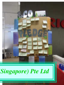
Ricoh (Singapore) Pte Ltd